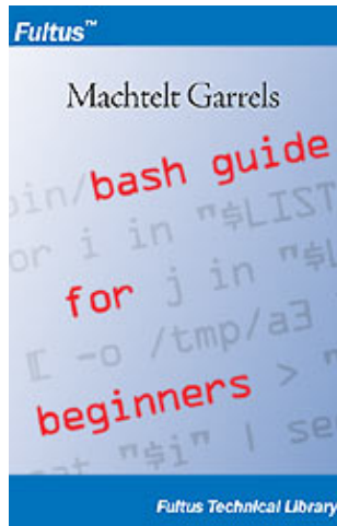
Figure 1. Bash Guide for Beginners front cover

This guide is available in print from Fultus.com .